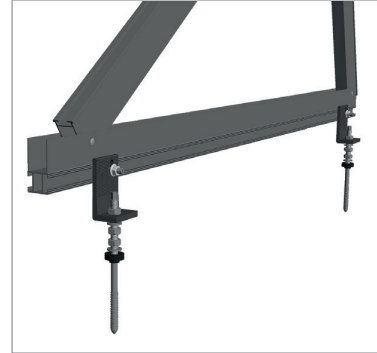
Adapter for hanger bolts