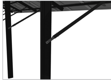
Linking of the diagonal to the C-post