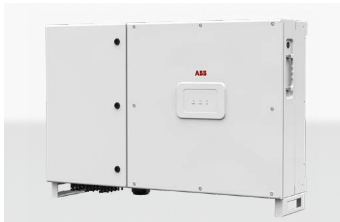
ABB string inverters PVS-50/60-TL