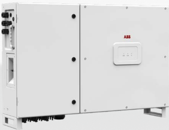
— PVS-50/60-TL string inverter

This new addition to the PVS string inverter family, with 3 independent MPPT and power ratings of up to 60 kW, has been designed with the objective to maximize the ROI in large systems with all the advantages of a decentralized configuration for both rooftop and ground-mounted installations.