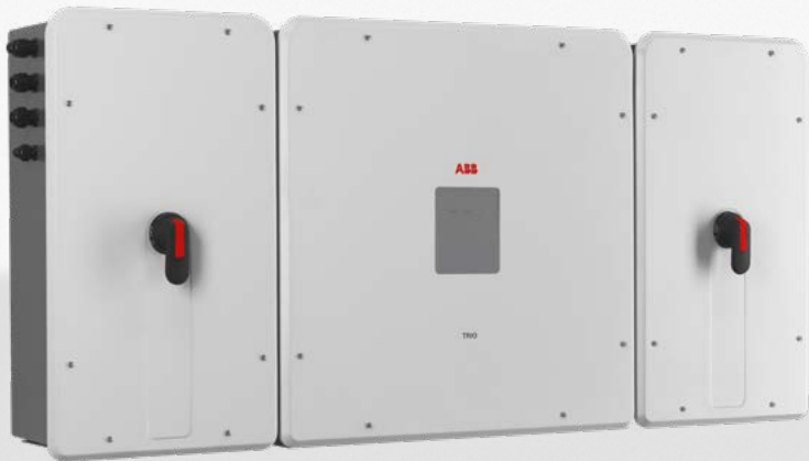
— TRIO-TM-50.0/60.0 outdoor string inverter

This new addition to the TRIO family, with 3 independent MPPT and power ratings of up to 60 kW (480 V version), has been designed with the objective to maximize the ROI in large systems with all the advantages of a decentralized configuration for both rooftop and ground-mounted installations.